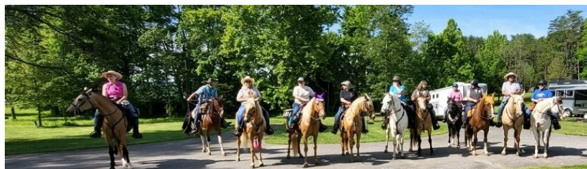
National Trail Ride - MFTHBA